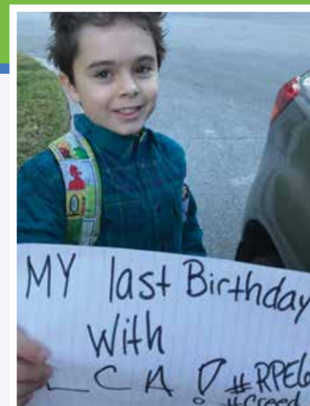
Creed on January 9, 2018 when he turned 9 years old.

People with LCA-RPE65 can't make a protein needed by the retina to convert light into vision-